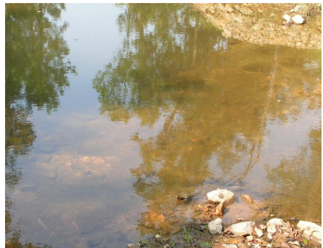
Photo 8 – A close up view of the AquaBlok in the completed section of the creek bed. The product was stained by the clay cover to resemble the natural stream bed.