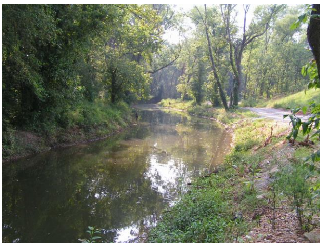
Photo 7 – A view of a section of the creek bed completed in fall of 2006. Photograph taken in August 2007 indicates a rapid recovery of natural stream habitat.

Current Status: Since the completion of installation in 2007 the barrier has been successful in sequestering potential residual contamination. The EPA has made statements that suggest that there is a potential for additional measures for passive or active product recovery of contaminants that may remain on the site. But the AquaBlok has been characterized as “extremely stable” by Craig Zeller, USEPA project manager for Region 4.