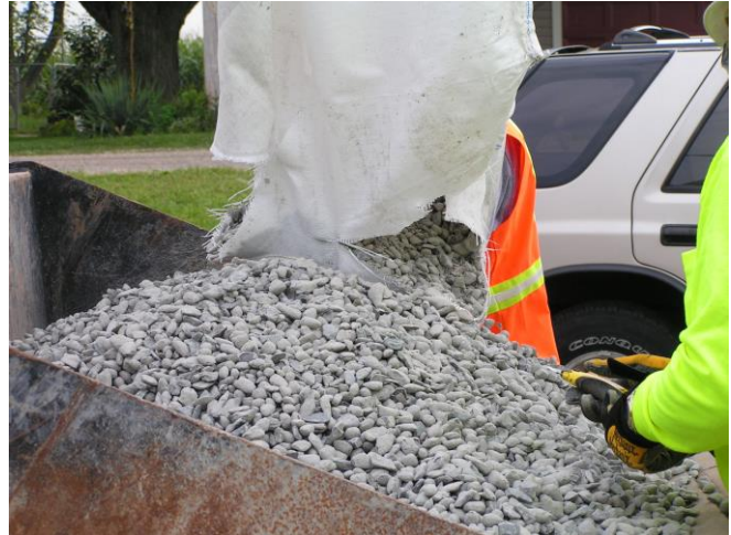
On-site Storage of AquaBlok Material and Transfer into Loader Bucket