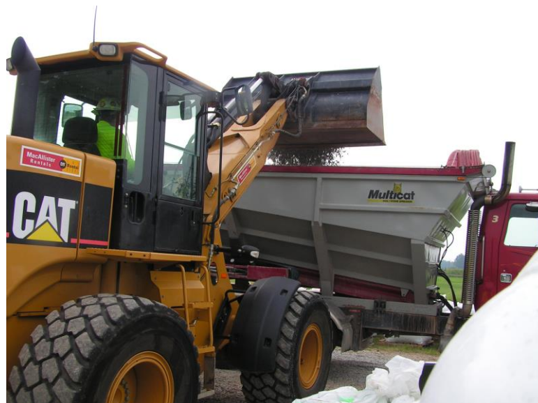
View of Rapid Loading the Stone Slinger

The actual installation time, including mobilization and all quality control aspects was approximately one week in duration.