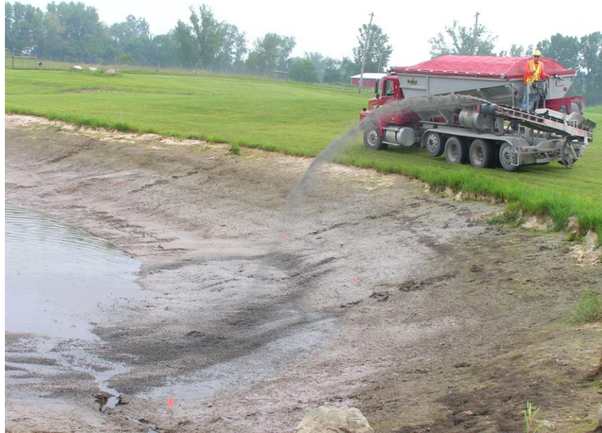
Overview of AquaGate+ORGANOCLAY being applied to pond basin

Setting / Purpose: Freshwater Pond – Provide treatment layer and low permeability barrier to address potential for residual oil seepage into pond.