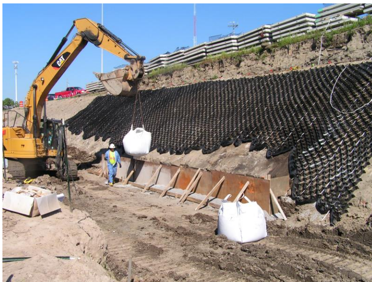
Above: AquaGate Placement into Form at Base of Slope

The design utilizes a “funnel & gate” treatment approach to direct and apply reactive, treatment materials to address the potential spread of the contaminant of concern from the seep zone. To accomplish this, a low-permeability layer of AquaBlok was placed on the slope to minimize migration and direct residual seep downward to the base of the slope. At the base of the slope, a permeable treatment zone was constructed using AquaGate+EHC-M materials. EHC®-M is a proprietary treatment material supplied by FMC Environmental. It has been tested and utilized in applications to remove metals and other contaminants from water. Due to the steep slope (approximately 1:1), a cellular slope stability material was used to maintain the AquaBlok prior to backfill.