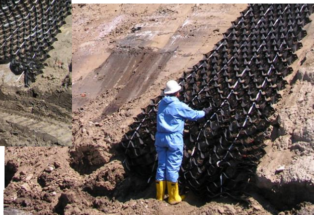
Below: Installation of Cellular Slope Stability Material (Geocell)