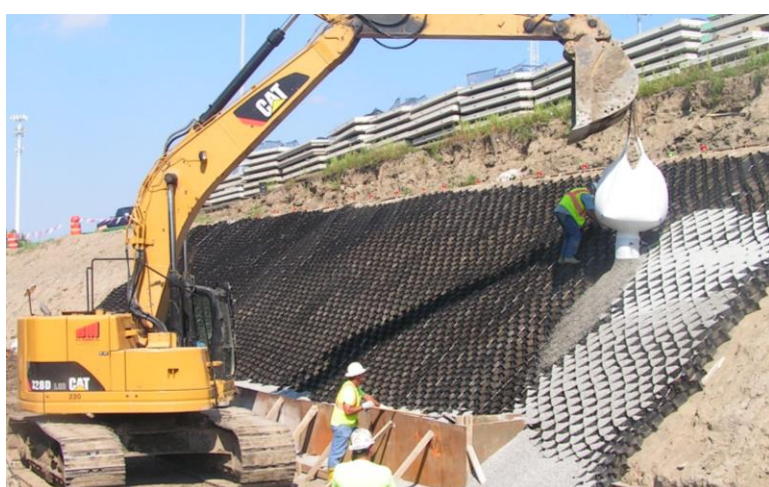
Above: AquaBlok Placement into Cellular Slope Stability Material