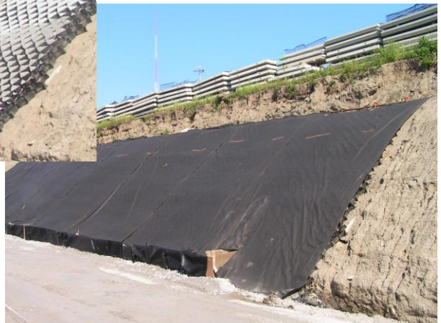
Below: Completed Installation with Geotextile Cover – For Protection Prior to Backfill of Slope