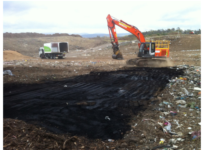
The finished RemBind cap on the burial pit

This is the first PFAS soil disposal project of this scale (1,000 tonnes) completed in Australia with EPA regulatory sign-off. This paves the way for the use of RemBind as a rapid, easy and cost-effective remediation strategy for mitigating the impact of PFAS contaminated soil on the environment. With proven long-term stability in a landfill situation, it also opens up the future possibility of re-using immobilized soil on site.