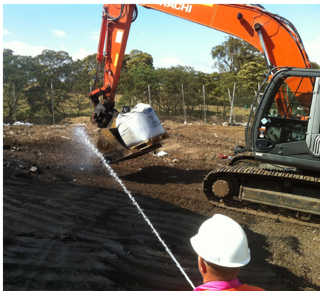
Adding RemBind to form the base of the burial pit

In this study, RemBind was used to reduce PFAS leachability in the soil to allow for safe disposal to landfill with regulatory approval.