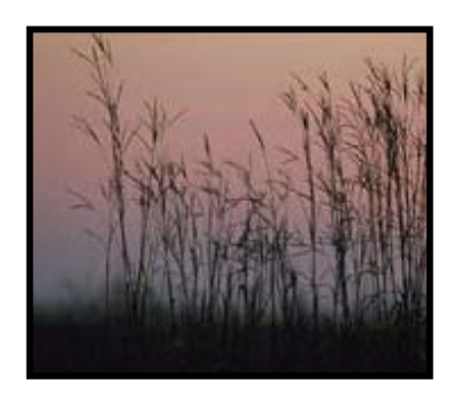
Big Bluestem Andropogon gerardii

Product coverage rates will vary depending on the species composition to be sown and the site-specific requirements for the project. However, due to the high bulk density of the material, a rate of 500 to 1,000 pounds of dry product per acre (0.01 – 0.02 lbs/SF) is a reasonable approximation of the quantity of material needed for a typical upland application.