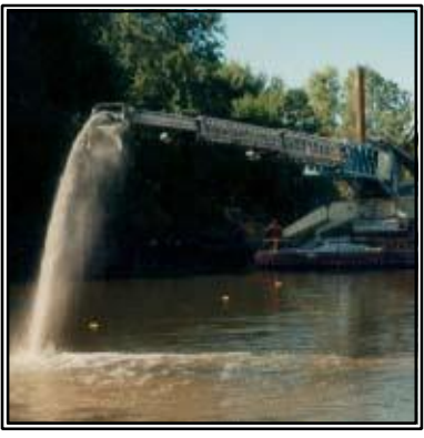
Photograph 1. Product applied using barge-based conveyor.

AquaBlok can also provide substrate for wetland vegetation and habitat for macroinvertebrate organisms, particularly when additional organic material is provided, either as part of the product formulation or as a surficial dressing. The AquaBlok technology can also deliver plant seeds to a targeted area